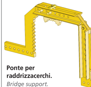
Ponte per raddrizzacerchi. Bridge support.